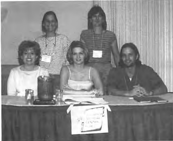
Research Medical Center Team 8 First place winners in the Student Bowl